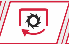
HIGHEST PTO POWER