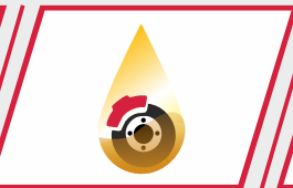
MULTI DISC OUTBOARD OIB