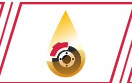
MULTI DISC OUTBOARD OIL