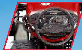
12+12 SOLIS SHUTTLE SHIFT