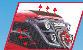
6 STAGE COOLING